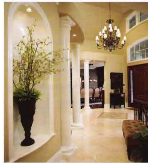
The home was crafted by The Bluffs' prolific builder, Jay Robinson Custom Home, known for exquisite attention to detail.

In the master bedroom, a subtle faux finish on the walls suggests Venetian plaster in golden brown and ivory. The poster bed with scrolled iron headboard faces a limestone fireplace. Matching rosewood bedside tables topped with faun-coloured marble hold a