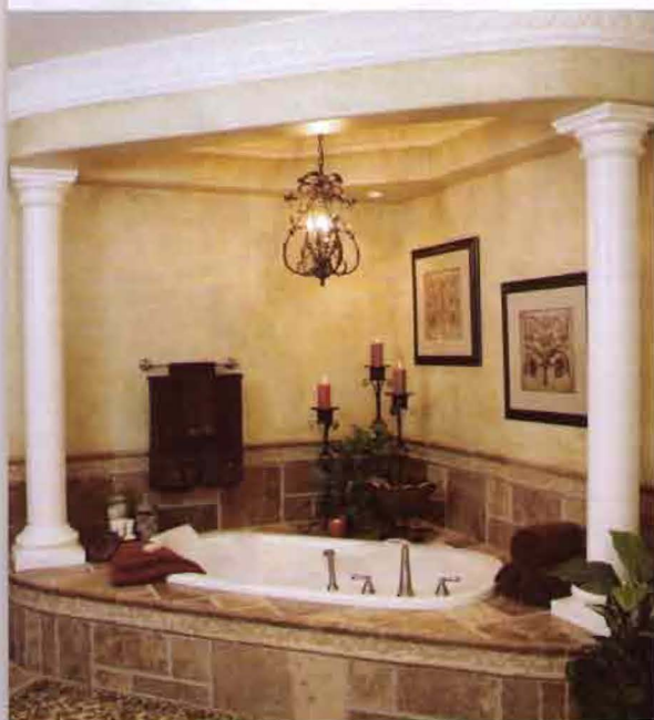
The dining room is steeped in formal charm (top). A bath beckons in the master en suite (above). Elegant embossed handles illustrate attention to detail (right)

matched pair of carved column table lamps crowned with dark brown silk shades. The master bedroom incorporates a solarium seating area furnished with an olive green chenille sofa and a jacquard armchair in golden fawn and olive. The seating area opens onto a lanai complete with a Ducane gas grill, multiple seating areas of black resin wicker furniture, wrought iron loungers with black and tan striped cushions, and an inviting hot tub with view to the outdoor television with surround speakers. "We have phantom screens that come down so it makes for another room in the summertime," explains Molkoski.