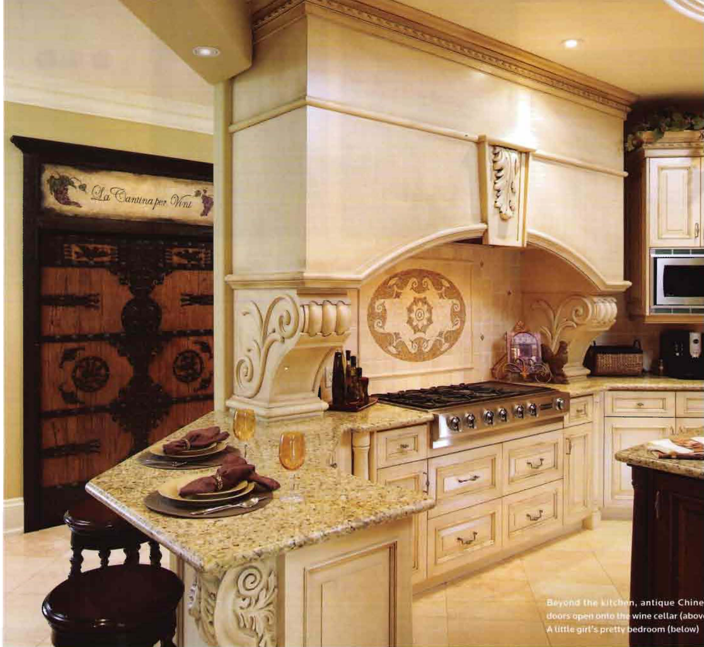
Beyond the kitchen, antique Chinese doors open onto the wine cellar (above). A little girl's pretty bedroom (below).